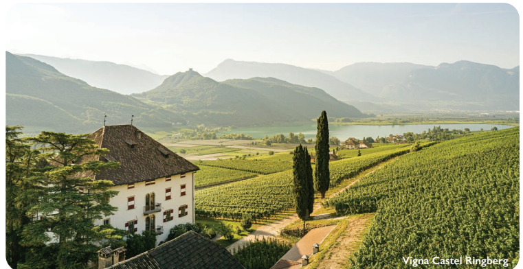
Vigna Castel Ringberg