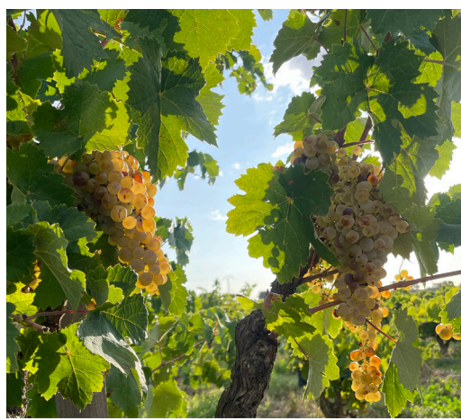
Domaine de Beurenard

As the season continues to unfold, stay tuned on our social media accounts as we follow the teams in the vineyards.