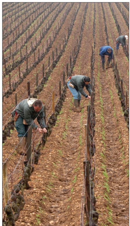
In January, tying of the vines in Les Pucelles, Puligny-Montrachet 1er Cru