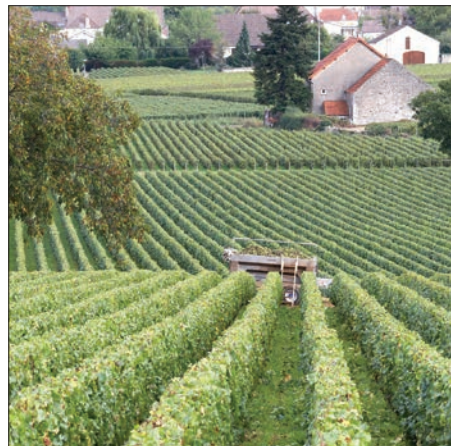
Clavoillon 1er Cru vineyard in foreground, "Les Brelances" Puligny-Montrachet in distance