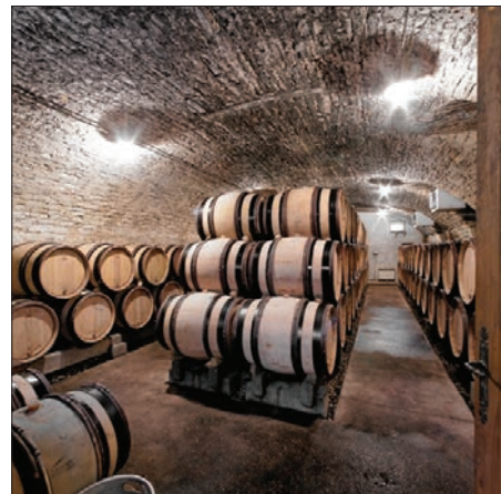
The incontestably clean barrel cellars at Domaine Leflaive