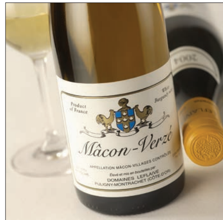
2011 is the eighth year that Domaines Leflaive's Maçon-Verzé vineyard has been 100% biodynamic.

Domaine Leflaive wines are very long-lived. Optimum drinking for the 2011 vintage, as recommended by the domaine, is: Bourgogne Blanc from 2013 onward Puligny-Montrachet from 2014 onward Premiers Crus from 2015 onward Grands Crus from 2017 onward Montrachet from 2019 onward