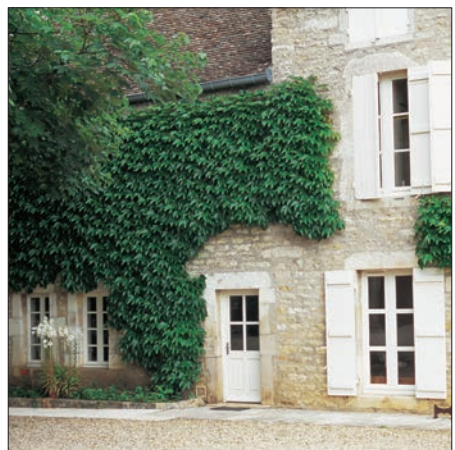
Domaine Leflaive's immaculate courtyard, Place des Marronniers, Puligny-Montrachet