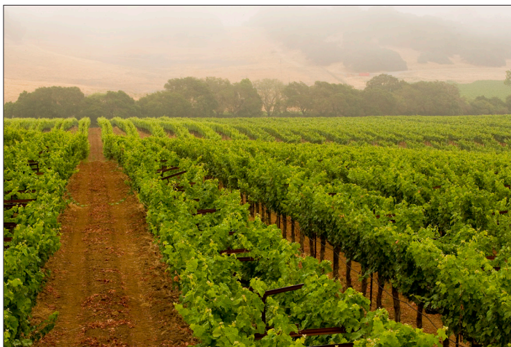
Grapevines shrouded in early morning fog, Carneros, Napa Valley

Aromatic with notes of tropical fruit, peach blossoms and apricots.